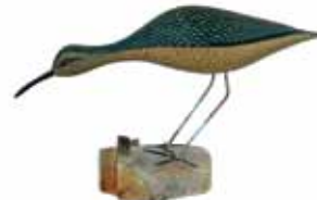
403 Feeding yellowlegs