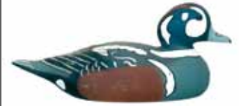
355 Herter Factory harlequin duck