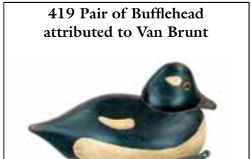
419 Pair of Bufflehead attributed to Van Brunt