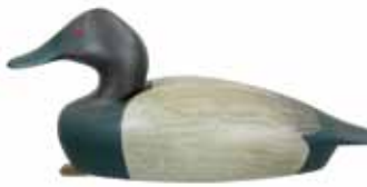
398 Canvasback drake by Chet Reneson