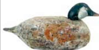
381 Mason Factory Canada goose