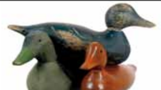
472 Three factory decoys