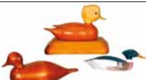
477 Lot of 3 miniatures from Martha's Vineyard