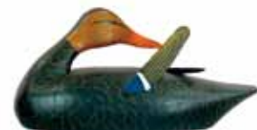
521 Crowell style black duck by Johnson