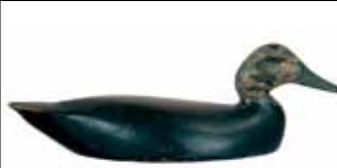
395 Black duck by Sam Denny