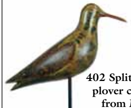
402 Split-tailed plover c1900 from MA