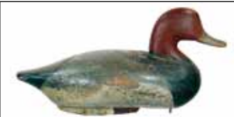
383 Redhead attributed to Daddy Holly