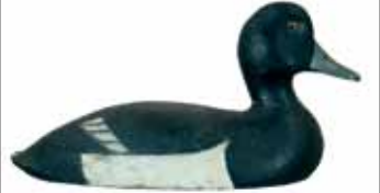
441 Outstanding bluebill drake