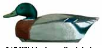
367 Wildfowler mallard drake