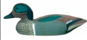
448 Herter Factory green-winged teal drake