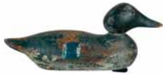
372 Mason glass eye canvasback