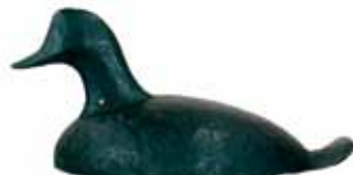
459 Common scoter from Lunenburg, /Nova Scotia