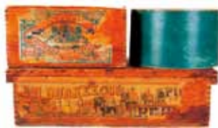
481 Three old boxes