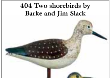
404 Two shorebirds by Barke and Jim Slack