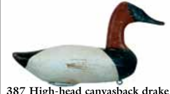
387 High-head canvasback drake by Jim Currier