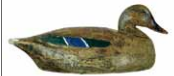
457 Mallard hen from Michigan