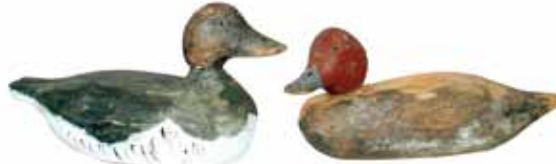
350 Lot of 2 decoys