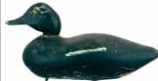
374 Early Mason goldeneye