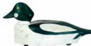
460 Goldeneye drake from Canada