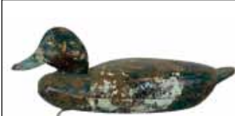
501 Connecticut bluebill