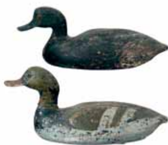
487 Two bluebills from Martha's Vineyard