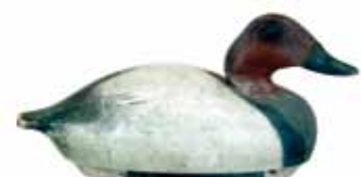
494 Wildfowler canvasback drake