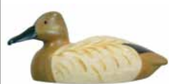
399 Canvasback hen by Reneson