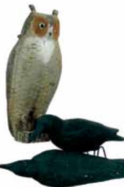
520 Rare Herter owl and two crows