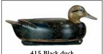
415 Black duck by Turk Libensperger, NJ