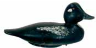
397 Goldeneye. Bacon pattern by the Mason Factory