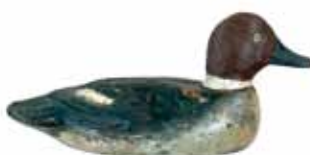
485 Petite goldeneye from Quebec