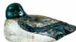
486 Sleeping goldeneye (whistler) from Quebec