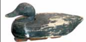
476 Lot of 2 Herter black ducks