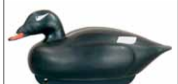
400 Hollow white-winged scoter