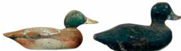
509 Lot of two decoys