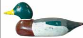
444 Mallard drake by the Mason Factory