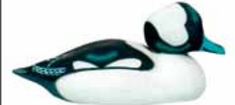
359 Herter Factory bufflehead drake