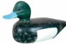
353 Lot of 2 decoys