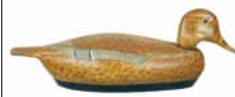
490 Stevens mallard hen in old paint