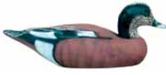
360 Herter Factory widgeon drake