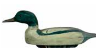
421 American merganser drake