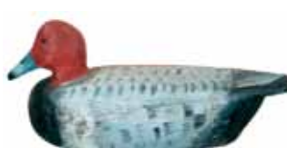
496 Redhead drake