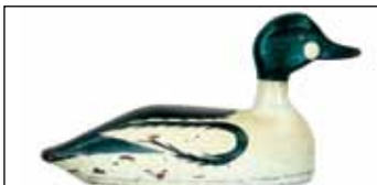
423 Goldeneye drake from Finger Lakes, NY