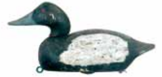
351 2 Mason premier cans