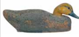
418 Cork and pine black duck by Dr. Starr