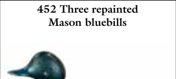
452 Three repainted Mason bluebills