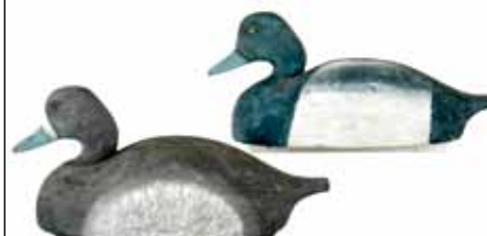
371 Pair of Wildfowler bluebills