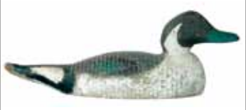
445 Factory made pintail drake