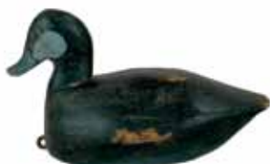
524 Ruddy duck