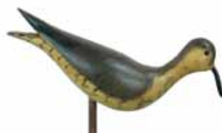
406 Feeding yellowlegs