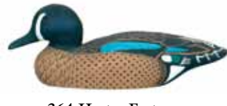
364 Herter Factory blue-winged teal drake