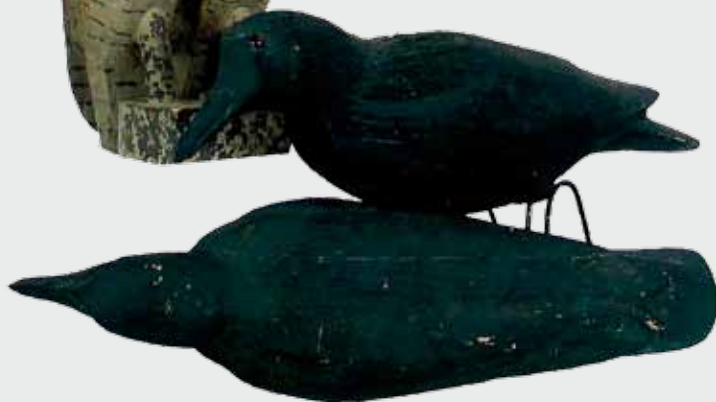
Rare Herter owl and two crows