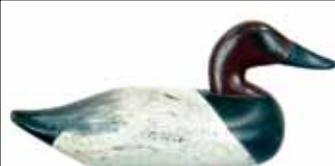
500 Early Mitchell can