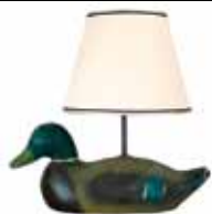
510 Animal Trap mallard (lamp)