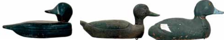
528 Lot of three decoys