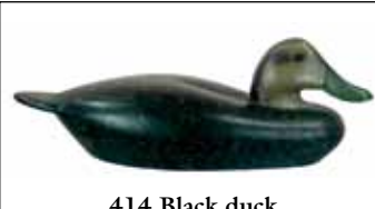
414 Black duck by Roswell Bliss, CT