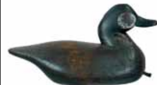
523 Ruddy duck NC