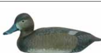
491 Redhead hen