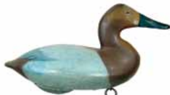
385 Canvasback drake, Maryland