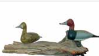
468 Pair of mini mallards