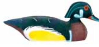
362 Herter Factory wood duck drake