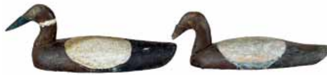
428 Pair of Louisiana cans