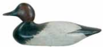
442 Canvasback drake by the Mason Factory