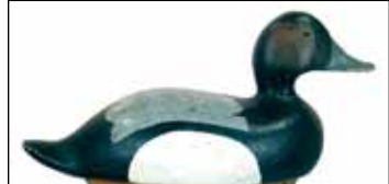
396 Bluebill drake