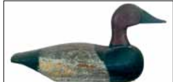
392 Canvasback drake from Church Island