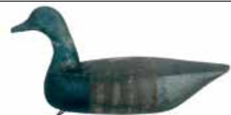
389 Hudson brant, Shourds model