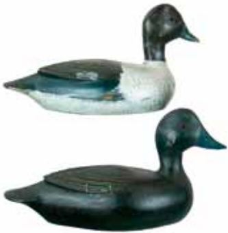
458 Goldeneye pair from Quebec