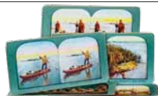
478 Twenty-eight Stereoptics