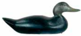
349 Mason challenge grade black duck