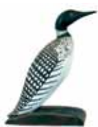
480 Miniature loon (7.5" high)