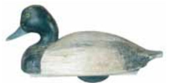
366 Wildfowler bluebill pair