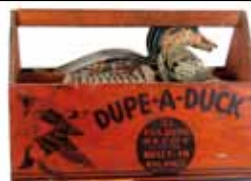
451 Unused set of Dupe-a-Duck mallards with carrying case