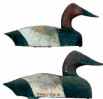
527 Pair of stylish canvasbacks