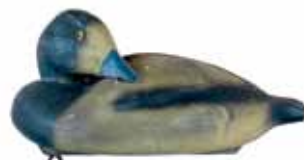
474 Animal Trap bluebill hen