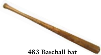
483 Baseball bat (Boys Home Run)