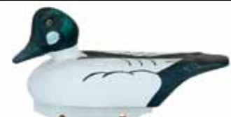
394 Goldeneye drake