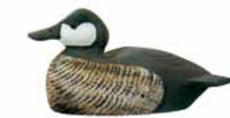
422 Ruddy duck and bufflehead by Clare Londrigin