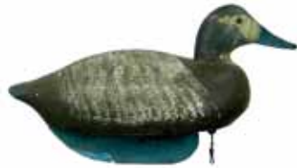
431 Can hen by Strubing, MI