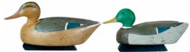
463 Mallard pair from Saginaw Bay