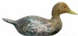
519 Mallards by Mittlestadt