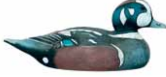
361 Herter Factory harlequin drake