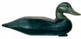
416 Black duck from New Jersey, Loder brand