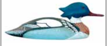
363 Herter Factory merganser drake