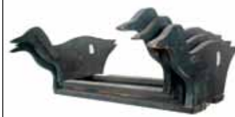
409 Three pair of scoter shadows