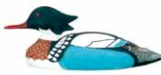
357 Herter Factory red-breasted merganser drake