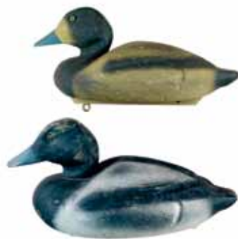
473 Pair of Animal Trap bluebills