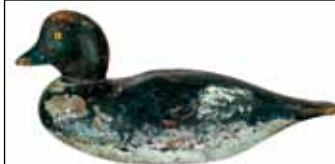
517 Goldeneye by Joseph Lincoln c1920