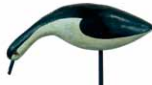
407 Feeding yellowlegs