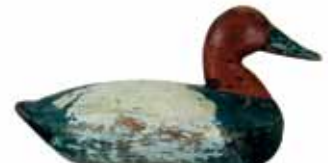
497 Chesapeake canvasback drake