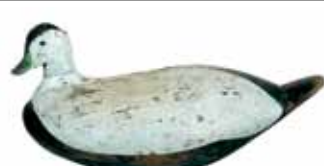
499 Maine cider drake