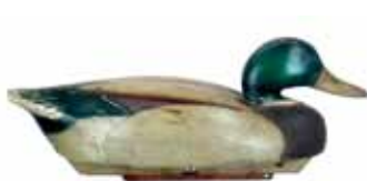
495 Wildfowler mallard drake