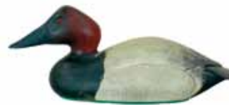
469 Canvasback mini by J B Garton