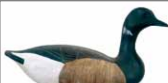
391 Brant from Chincoteague