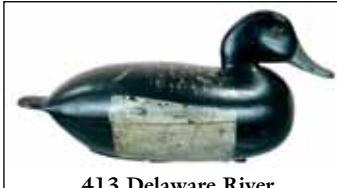
413 Delaware River bluebill drake by Jack English