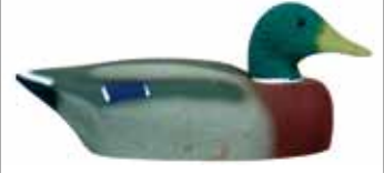
449 Mallard drake by the Herter Factory