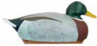
401 Mallard decoy of cork and pine