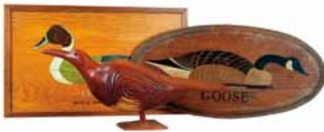
470 Two plaques and one bird carving