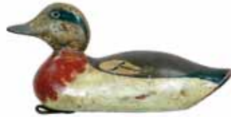
373 Mason widegeon drake