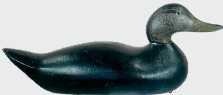
Mason challenge grade black duck