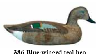
386 Blue-winged teal hen by Jobes