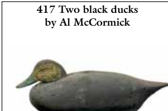
417 Two black ducks by Al McCormick