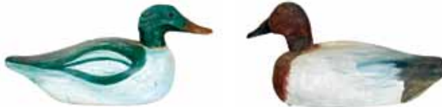
354 Lot of 2 decoys from Martha's Vineyard