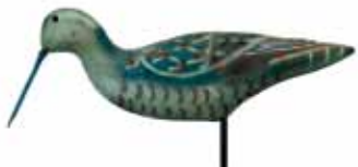
365 Herter Factory curlew