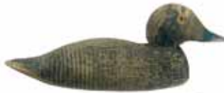
377 Lot of 2 factory decoys