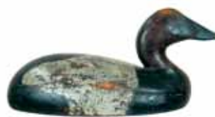
456 Bobtail canvasback from Michigan