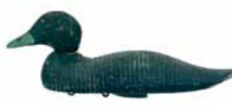
447 Black duck by the Victor Factory