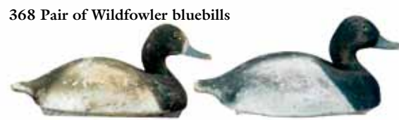
368 Pair of Wildfowler bluebills