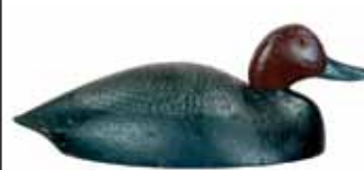
436 Redhead drake by Warin