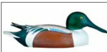
426 Shoveler drake by Curtis Chauvin