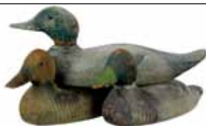
511 Lot of 9 factory decoys (3 pictured)