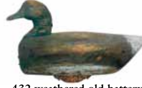
432 weathered old battery can from NC