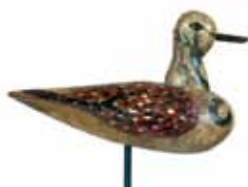
525 20th century ruddy turnstone