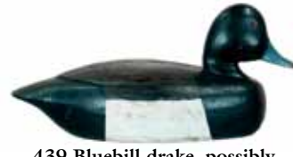
439 Bluebill drake, possibly by Anger family