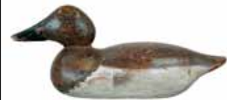
513 Mason canvasback hen