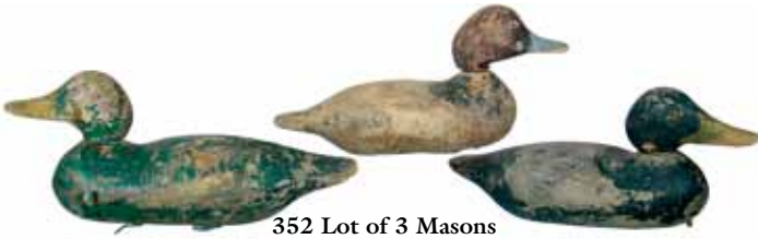
352 Lot of 3 Masons