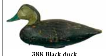
388 Black duck by Delbert Hudson