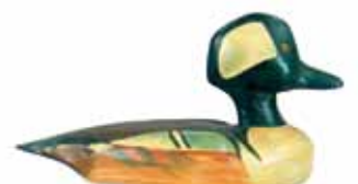
420 Hooded merganser drake