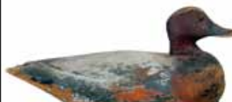
516 Early Crowell redhead c1890