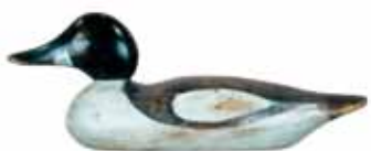
514 Mason merganser drake