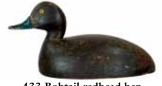
433 Bobtail redhead hen from Michigan