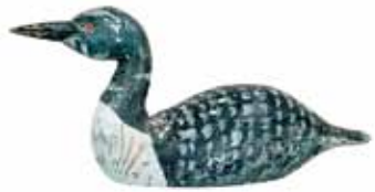
430 Loon, antiqued surface