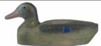
450 Mallard hen by the Herter Factory