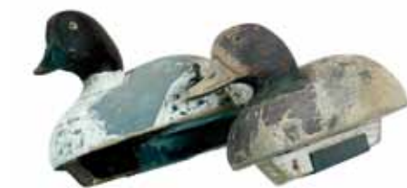
370 Lot of 2 repainted Wildfowlers