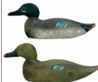
506 Pair of Animal Trap teal