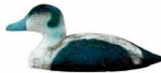
358 Herter Factor eider drake