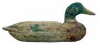
434 Mallard drake from the Illinois River