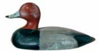
438 Michigan redhead drake