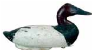
498 Chesapeake can (H Harding Brown)