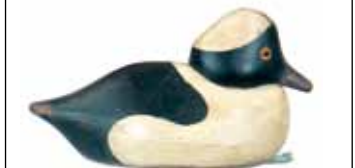
419 Pair of Bufflehead attributed to Van Brunt