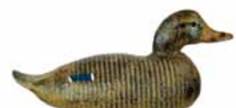
446 Mallard hen, factory made