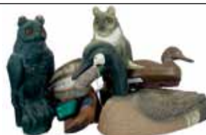
512 Lot of 5 decoys