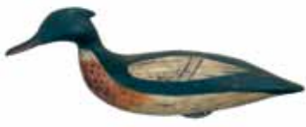
427 Merganser drake