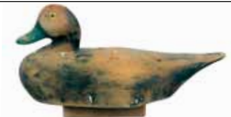
382 Decoy with little paint remaining