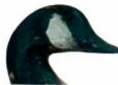
410 Canada goose decoy head