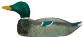
376 Factory mallard drake