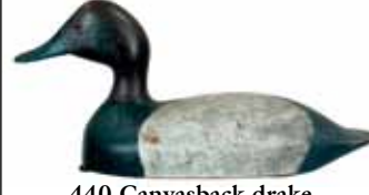
440 Canvasback drake, Alexandria Bay, NY