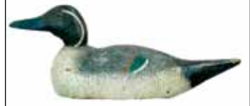
375 Factory pintail drake