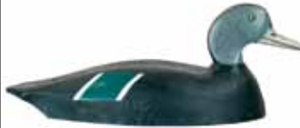
378 Black duck made from tin