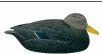
493 Black duck by Bill Conroy