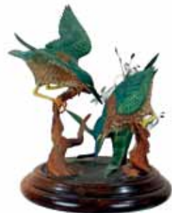
467 Nightheron by Bernice Culver