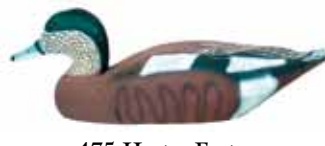
475 Herter Factory widgeon drake