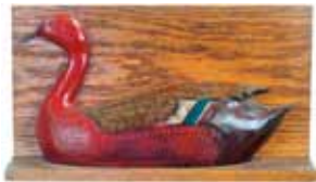
408 Half model of a decoy