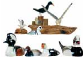
465 Eight bird figures