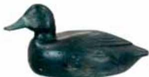
484 Bluebill, possibly Orel LeBouef