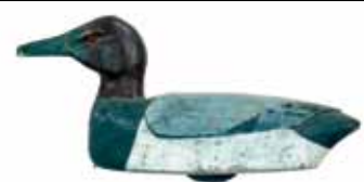
393 Canvasback by Taddie & Dewey Pertuit