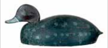
437 Redhead drake from the St. Clair Flats