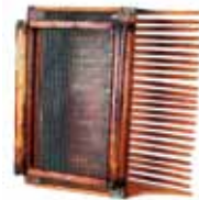
482 Cape Cod cranberry scoop