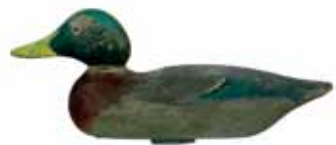
507 Mason Factory mallard drake