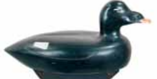
435 White-winged scoter by Oliver