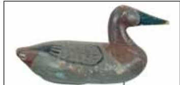
384 Canvasback hen from Susquehanna River