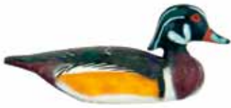
356 Herter Factory wood duck drake