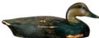
515 Wildfowler black duck